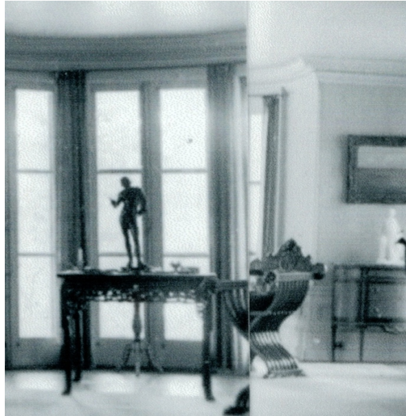
Chair in historic photo Opendore Drawing Room