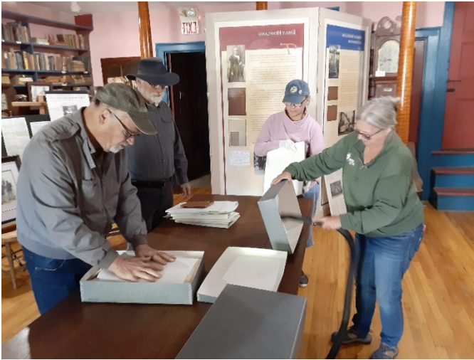
Collections committee working on ledger boxes moved from Stone Store to Archive Room.