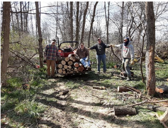
Volunteers maintaining nature trail