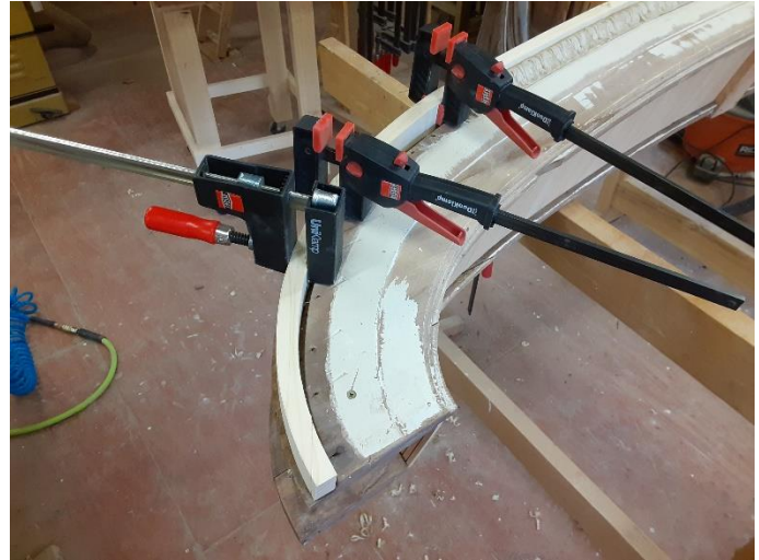
Hallway Arch being restored