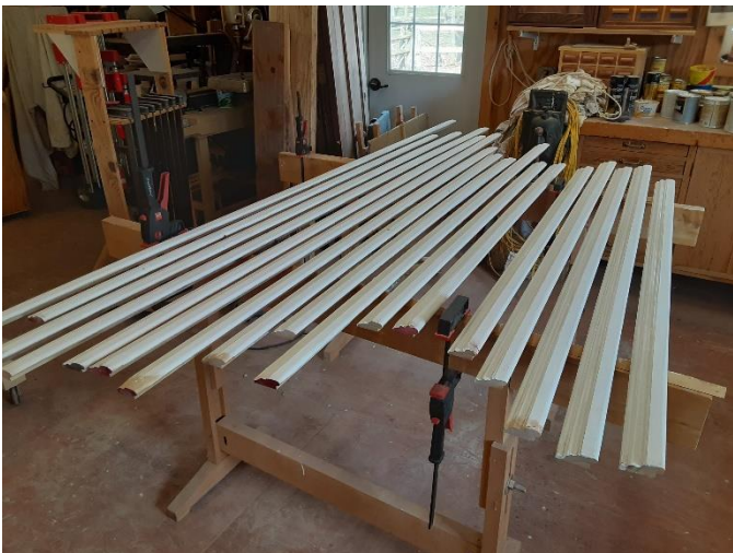
Shop fabricated picture rail

Work continues on restoring historic trim in several home workshops. This will position us for installation once we can resume group work at the building.