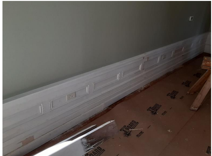
Restored Drawing Room Wainscot being reinstalled