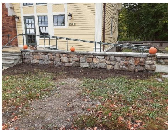
Stone Veneer installation on Handicapped Ramp