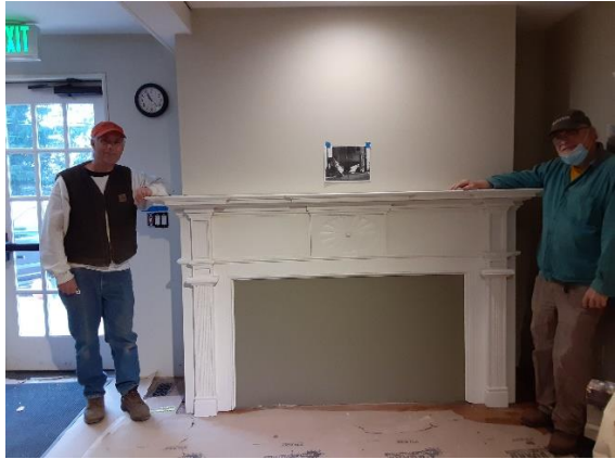
Refurbished historic mantel installed in White Entry Hall