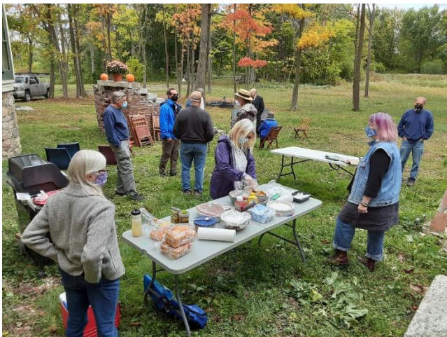
Volunteers enjoy a socially distant outdoor picnic early October