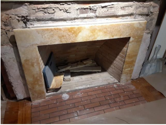
Marble Surround Drawing Room Fireplace