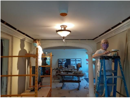
Trim Restoration and Painting