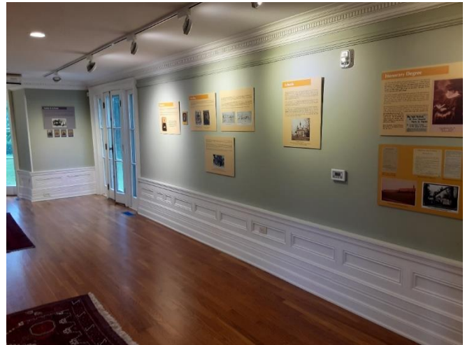
CRUMRINE-HOWLAND-WHITE DRAWING ROOM

Moving upstairs, the Builders Gallery is devoted to a recreation of the Cayuga County Political Equality Club, c. 1917, with some of the very same posters on the walls.