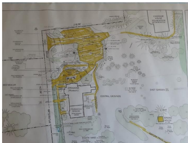
SITE PLAN FOR PROPOSED PHASE V

The Phase V design eliminates parking at the front of the building, as it is unsafe and blocks the building facade. Instead, a parking lot will be built on the north side of the building, including bus and handicapped parking. Handicapped accessibility will be provided to the ramp on the west side of the building. Phase V also includes historic tree, flower and shrub planting, providing shade trees along the road to frame the west façade, as depicted in early photographs.