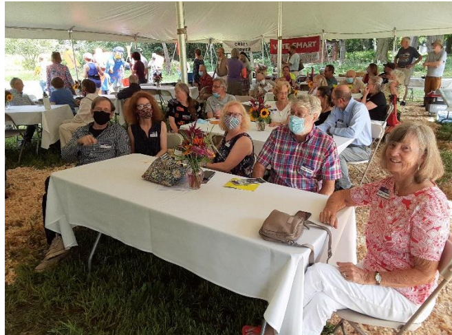
CENTENNIAL TENT AND GUESTS