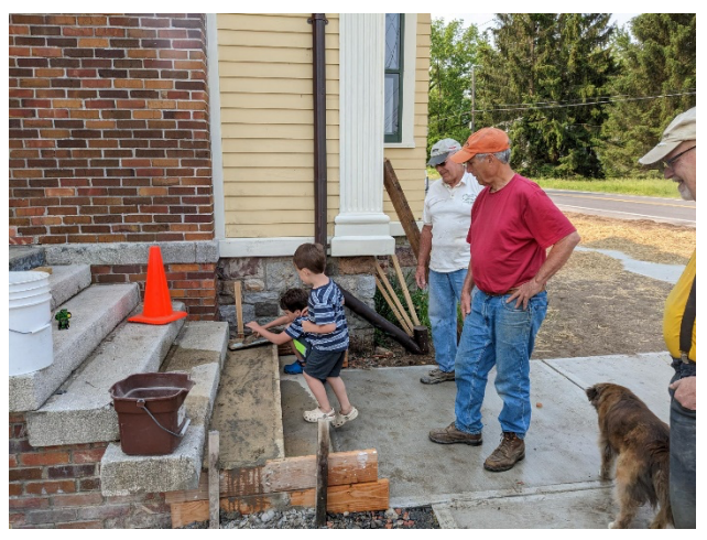
Our youngest volunteers!!