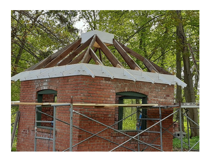
Roof Framing with Scrolled Outlookers on Rafters

The "Tuesday-Thursday-Saturday Gang" has been very active in May with the reconstruction of the historic Springhouse behind Opendore. The twelve-foot square brick structure which was in bad condition has been carefully rebuilt to its original design, using photographs and salvaged components as guides. With its pyramid roof and eave overhangs with sculpted rafter outlooks, the structure has a resemblance to an historic train station. Much of the material for the reconstruction was salvaged from the historic 1895 Carriage House at Opendore. Please stop by and walk out back to enjoy the "new" Springhouse.