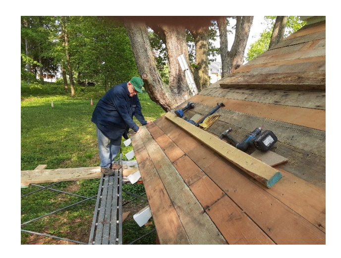
Roof planking salavaged from Carriage House