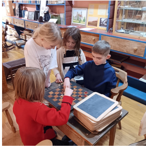
an old fashioned game of checkers

Come see us! The Museum will be open for visitors May 4, with a Gala Exhibit Opening on June 15.