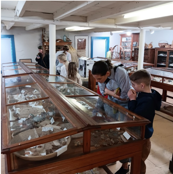
Examining the Cabinet of Curiosities