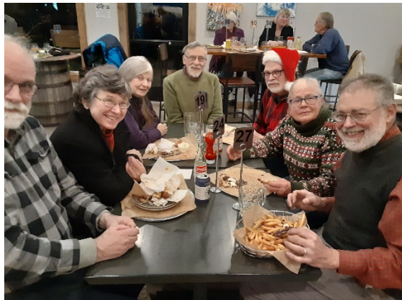
Volunteer dinner at Aurora Brewery

A docent refresher training session for our experienced docents is scheduled for Wednesday April 18 th , 9:00 to 11:00 AM this year. This is the opportunity to meet our group and learn about the role of docents.