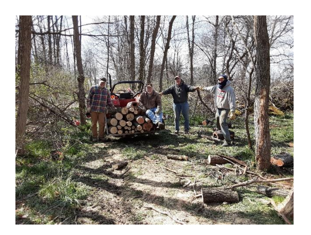
Volunteers maintaining nature trail