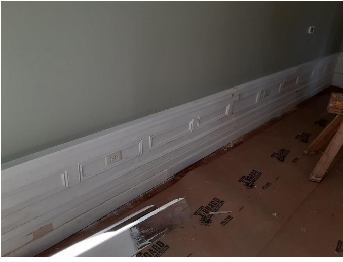
Restored Drawing Room Wainscot being reinstalled