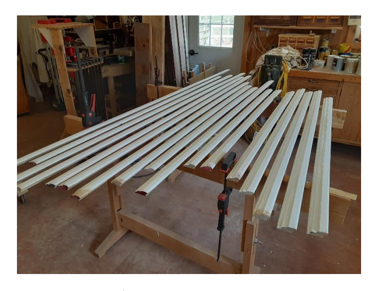
Shop fabricated picture rail

Work continues on restoring historic trim in several home workshops. This will position us for installation once we can resume group work at the building.