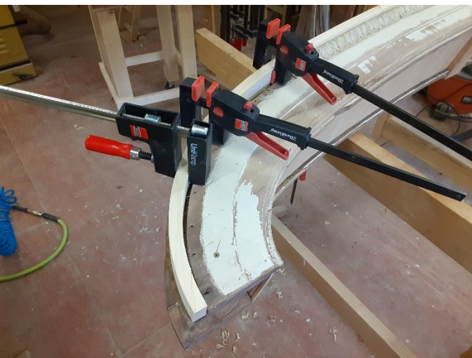
Hallway Arch being restored