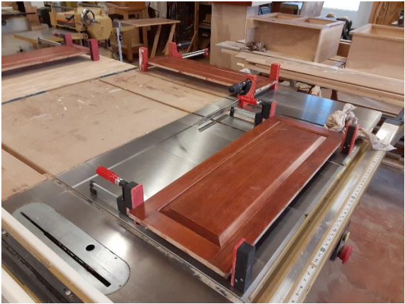
Kitchenette cabinet doors in fabrication by Guy Garnsey