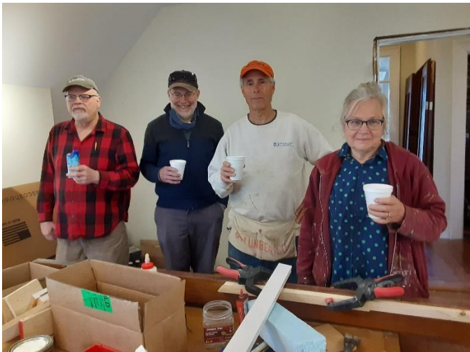
Coffee Break at Opendore