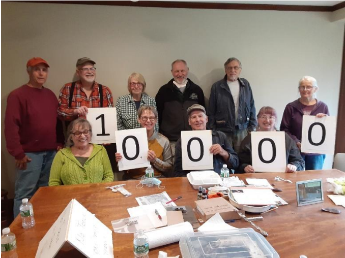
Opendore Volunteers celebrate 10,000 hours since October 2016 !!!