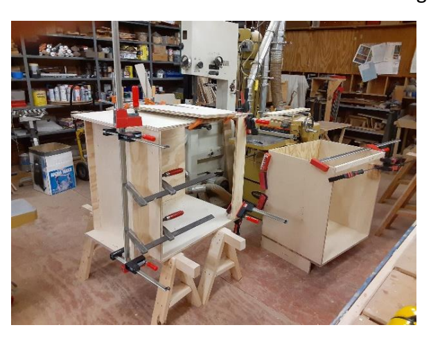
Additionally, Guy is fabricating new cabinets for the Kitchenette, which will be installed in the near future.