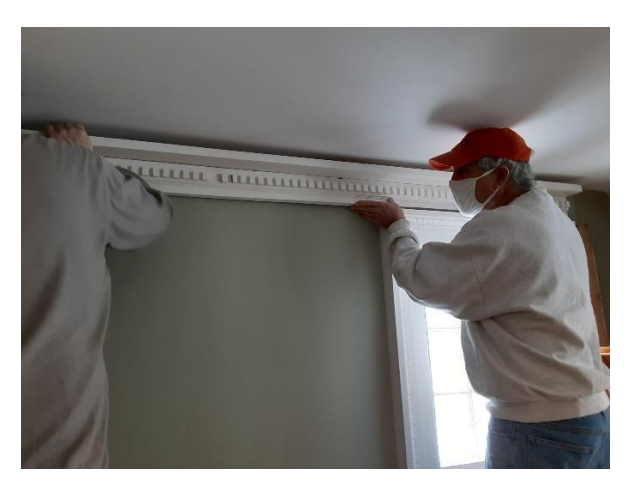
Trim installation and painting